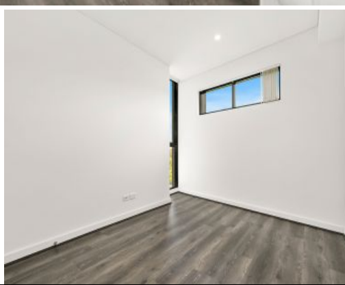
408/79 Regent Street Kogarah, NSW