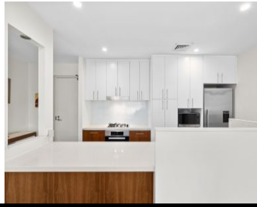
301/9-19 Myrtle Street Botany, NSW