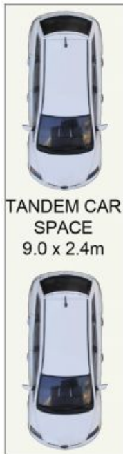
TANDEM CAR SPACE 9.0 x 2.4m