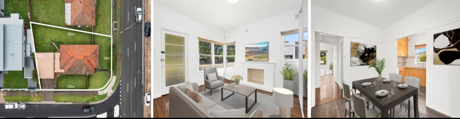
453 Princes Highway Carlton, NSW