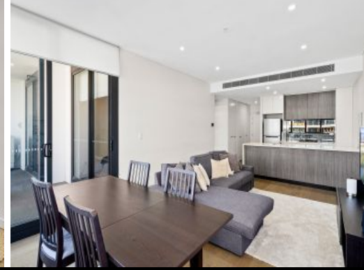
504/15 Garrigarrang Avenue Kogarah, NSW