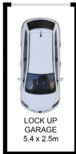
LOCK UP GARAGE 5.4 x 2.5m

(NOT SHOWN IN ACTUAL LOCATION / ORIENTATION)