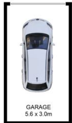
GARAGE 5.6 x 3.0m (NOT SHOWN IN ACTUAL LOCATION / ORIENTATION)